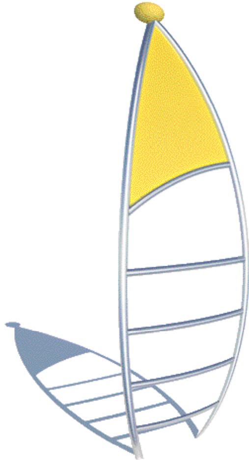
Diagram 1: Overall view of the play equipment