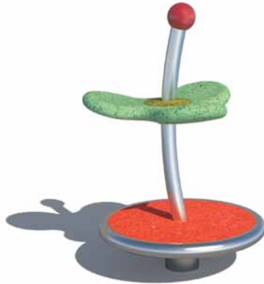
Diagram 1: Overall view of the play equipment