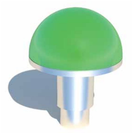
Diagramm 1: Overview of the equipment