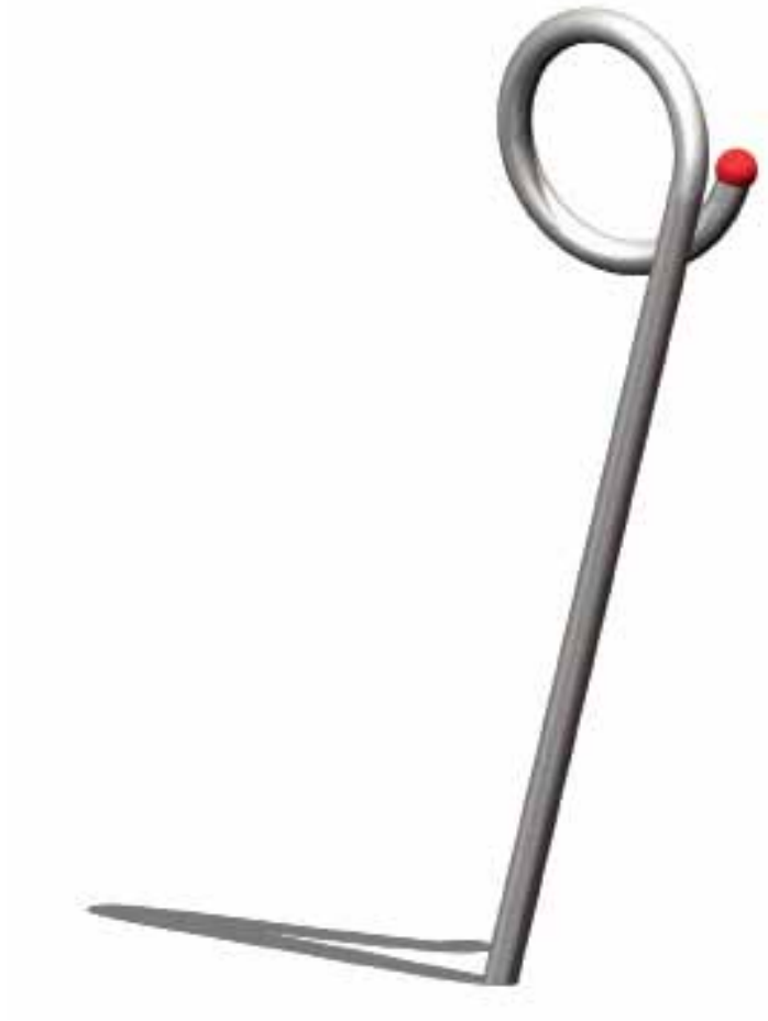
Diagram 1: Overall view of the play equipment