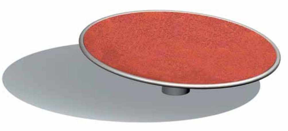
Diagram 1: Overall view of the play equipment