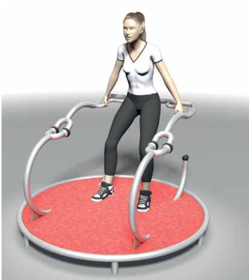
Diagram 1: Overall view of the fitness equipment