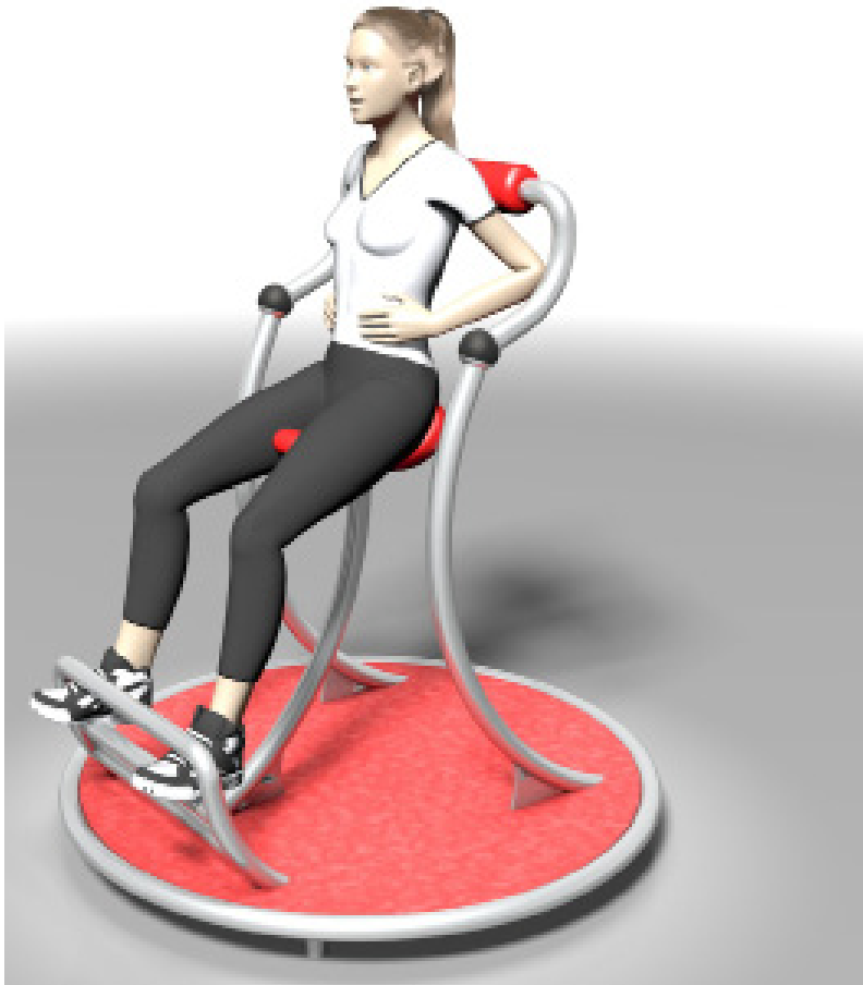
Diagram 1: Overall view of the fitness equipment