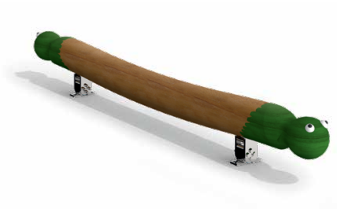
Diagram 1: Overall view of the play equipment