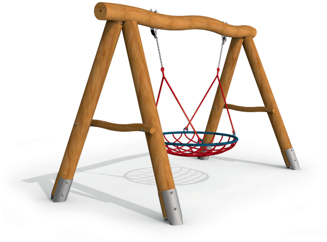
Diagram 1: Overall view of the play equipment