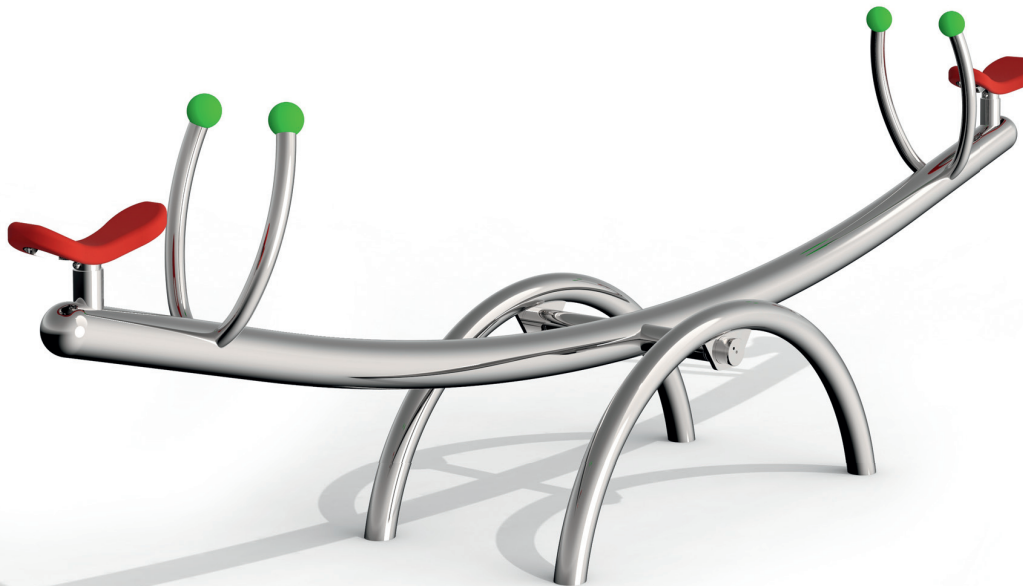
Diagram 1: Overall view of play equipment