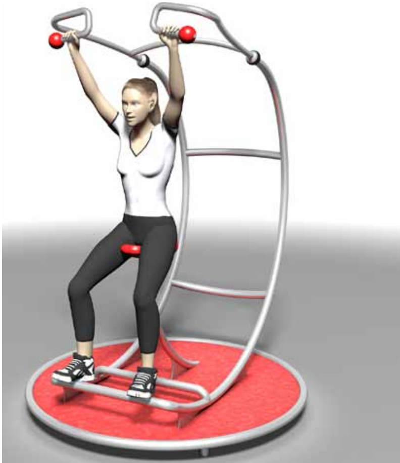
Diagram 1: Overall view of the fitness equipment