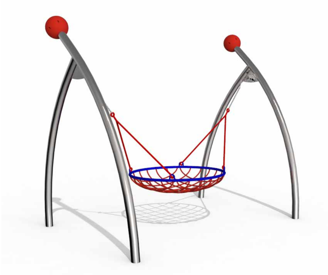
Skizze 1: Gesamtansicht des Spielgerätes