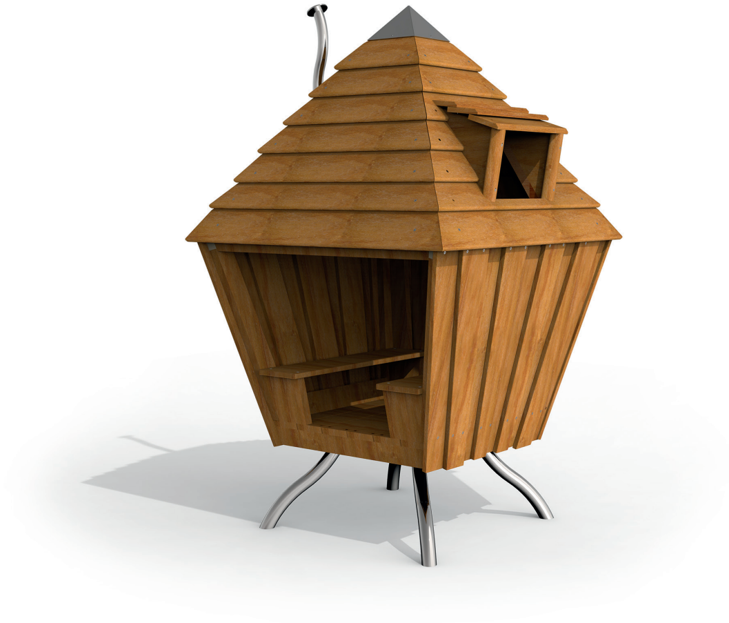
Diagram 1: Overall view of play equipment