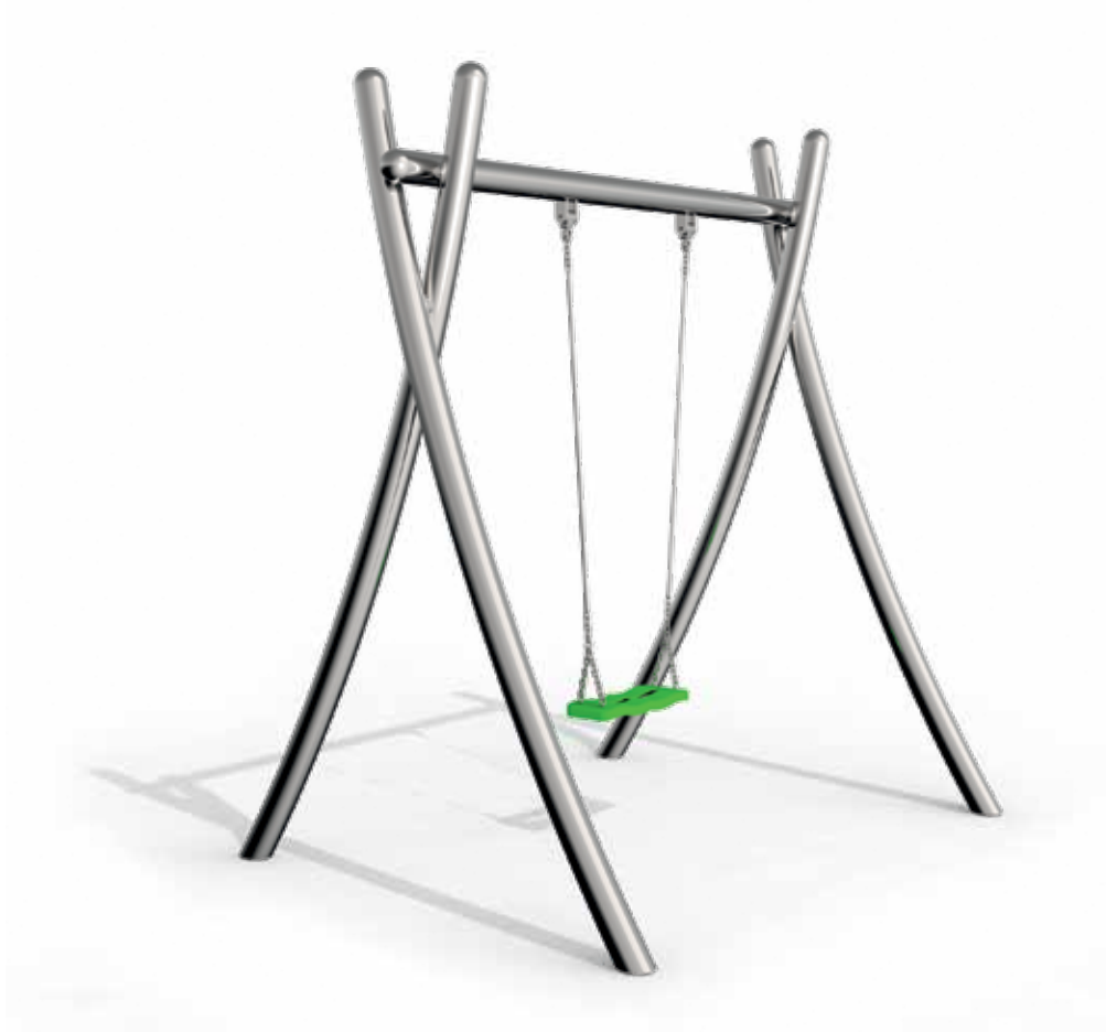
Diagram 1: Overall view of the play equipment