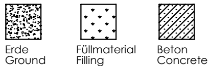
Diagram 2: Foundation