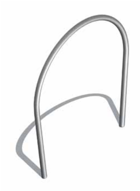
Diagram 1: Overview