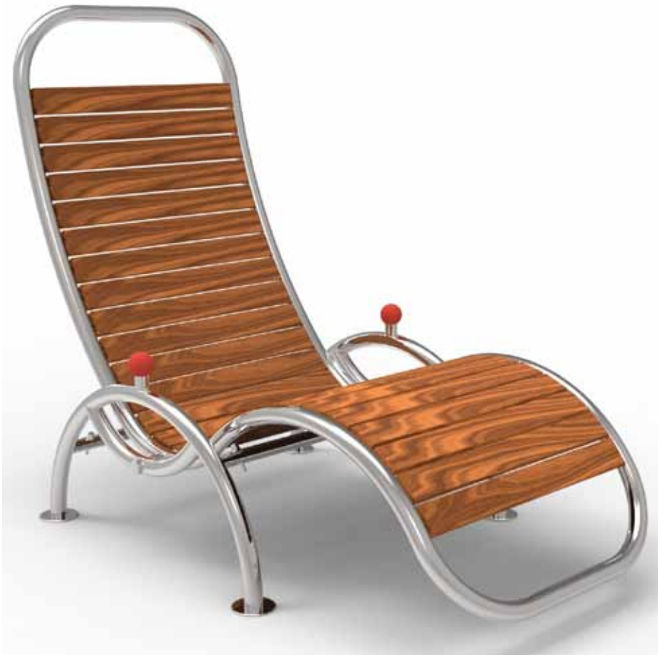
Diagram 1: Overall view of the lounge