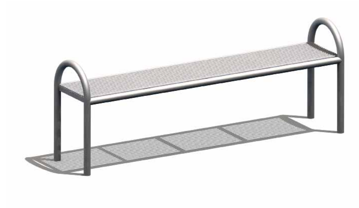
Diagram 1: Overall view of the bench