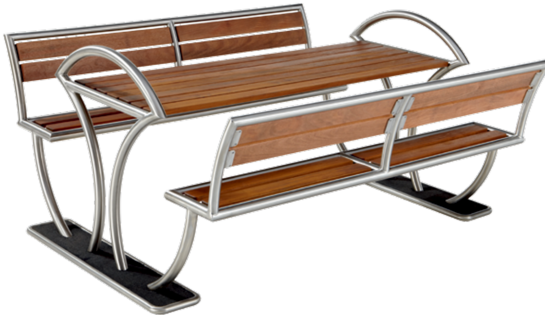
Diagram 1: Overall view of the bench