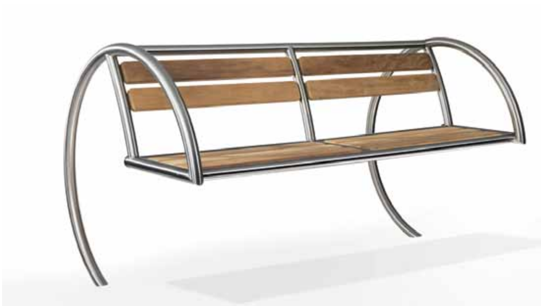
Diagram 1: Overall view of the bench