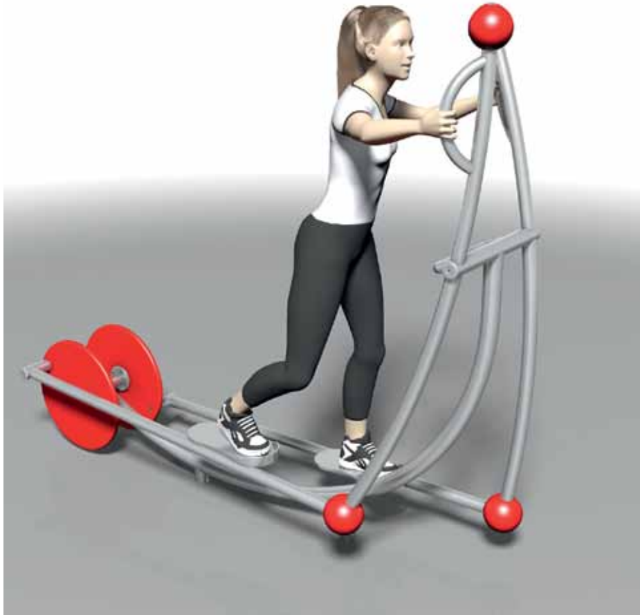
Diagram 1: Overall view of the fitness equipment