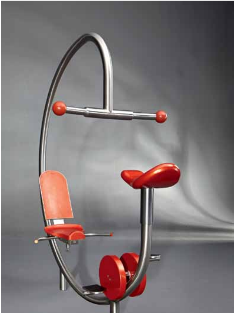
Diagram 1: Overall view of the fitness equipment