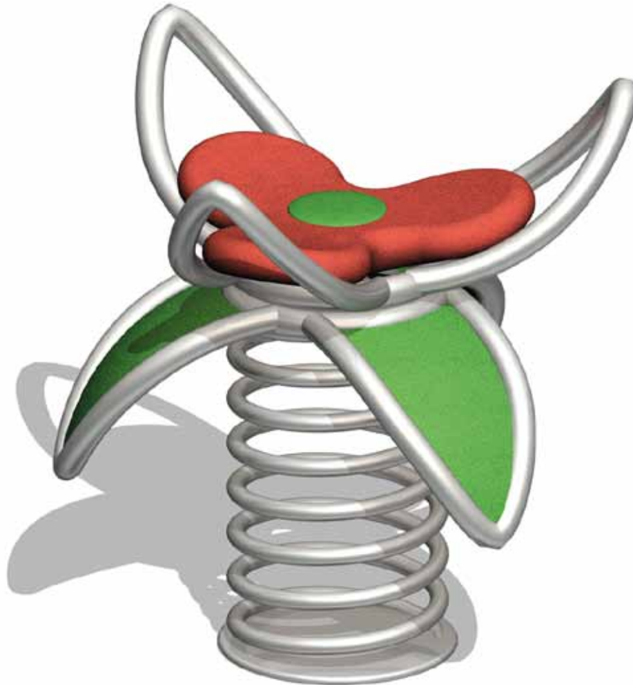
Diagram 1: Overall view of the play equipment